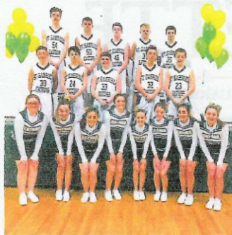
JV/ VARSITY BOYS